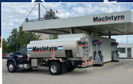
Exchange Street TODAY