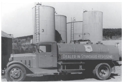
Seymour Street 1943