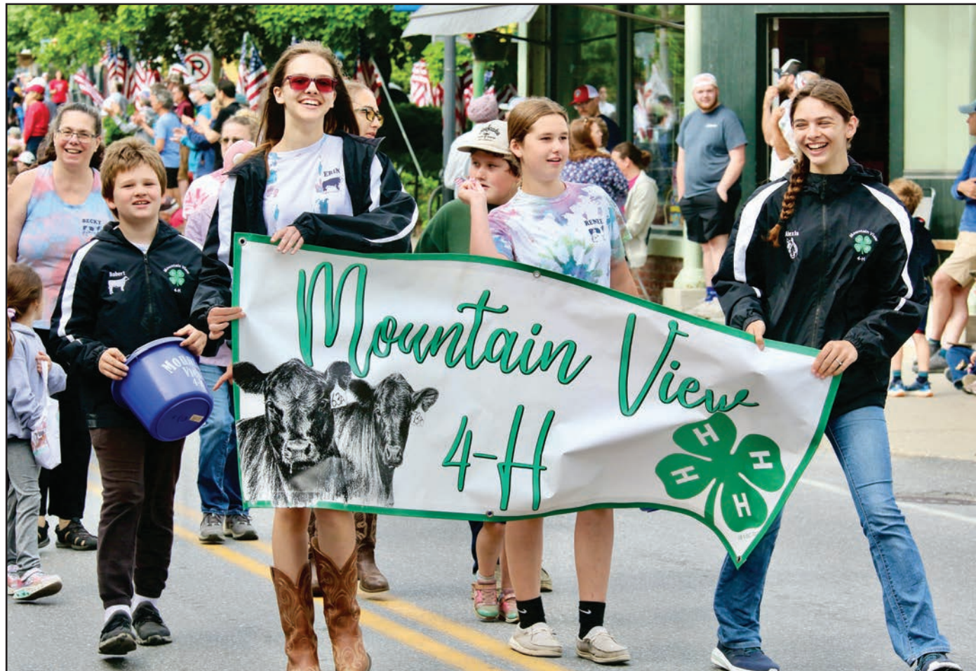
NO ONE APPRECIATES good weather on Memorial Day more than the people who march in the parades. These folks in the Mountain View 4-H Club are clearly enjoying their interactions with the crowd along Middlebury's Main Street in 2024.