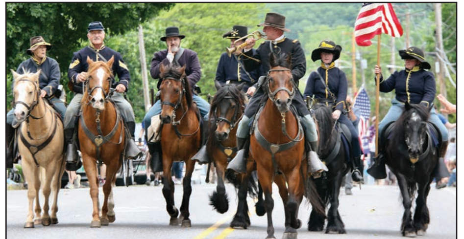
A LEADER OF Union cavalry blows his horn to alert his contingent of U.S. Civil War re-enactors during the 2024 Vergennes Memorial Day Parade. The Union soldiers are always a big hit at local parades.

All are welcome at Bristol's Memorial Day Ceremony.