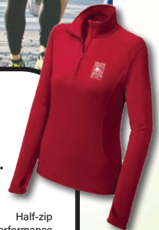
Half-zip performance shirts available when you register!

Brought to you by ADDISON COUNTY INDEPENDENT